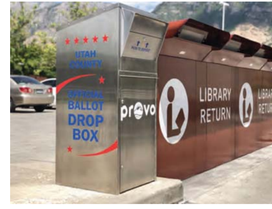
A ballot drop box will be located outside the Provo City Library