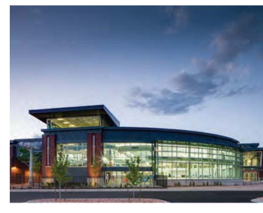
A Voter Service Center will be located at the Provo City Recreation Center on Election Day

VISIT VOTEPROVO.COM CALL (801) 852-6524 EMAIL RECORDER@PROVO.ORG