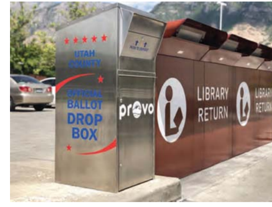
A ballot drop box will be located outside the Provo City Library