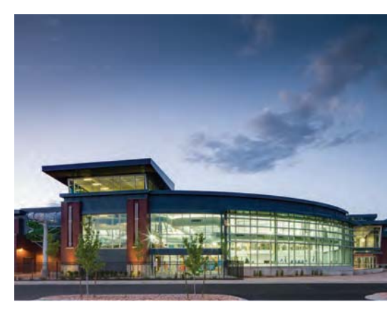
A Voter Service Center will be located at the Provo City Recreation Center on Election Day

VISIT VOTEPROVO.COM CALL (801) 852-6524 EMAIL RECORDER@PROVO.ORG